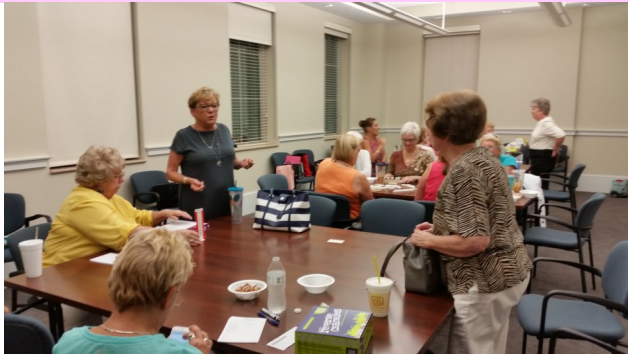
Left: August Game night where more than 18 ladies participated in various games.