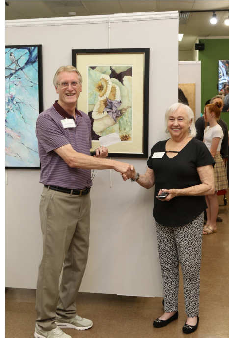
Mint Hill Arts