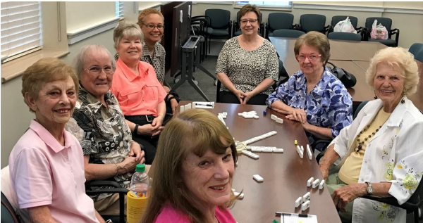
August Game night with Mexican Train