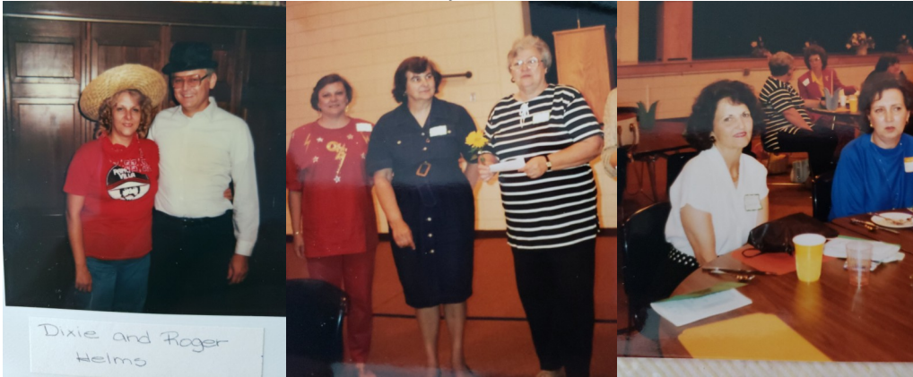
These faces haven't changed at all