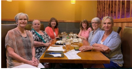
June Lunch Bunch at Mr Toyoko Restaurant