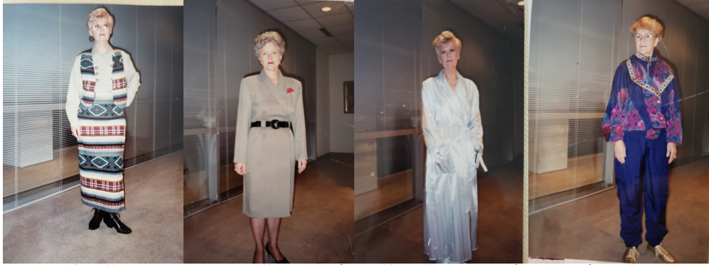
The latest in Fashion for the late 70's - 80's

For the next 5 months, we will be posting various pictures from our past history as a club. We will divide them up by decade. Join us in marveling at our predecessors.