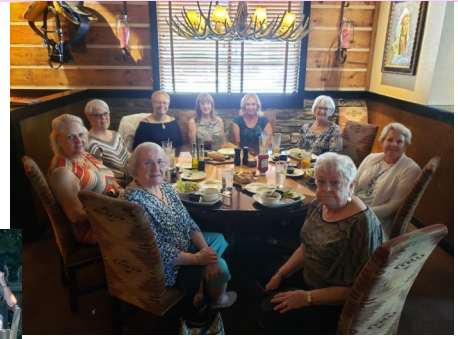
July Lunch Bunch at Longhorn