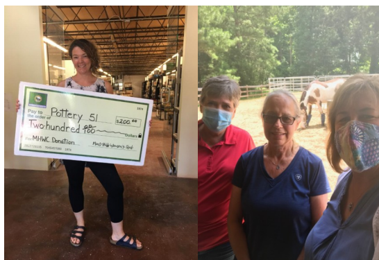
Donation to Mending Strides