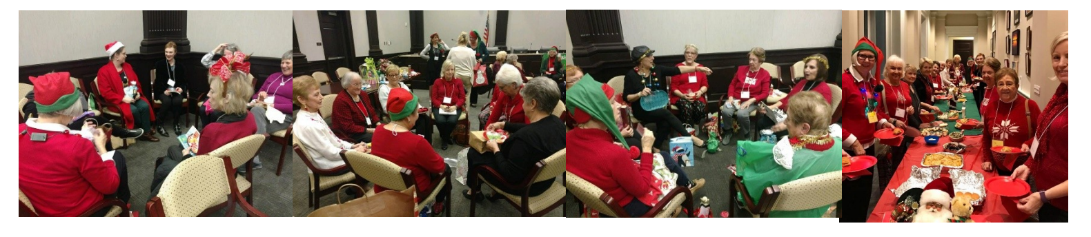
Before taking a stroll along an extensive smorgasbord of sweet and savory delicacies, and checking their raffle tickets! All in all, it was a delightful evening of fun and comradery!