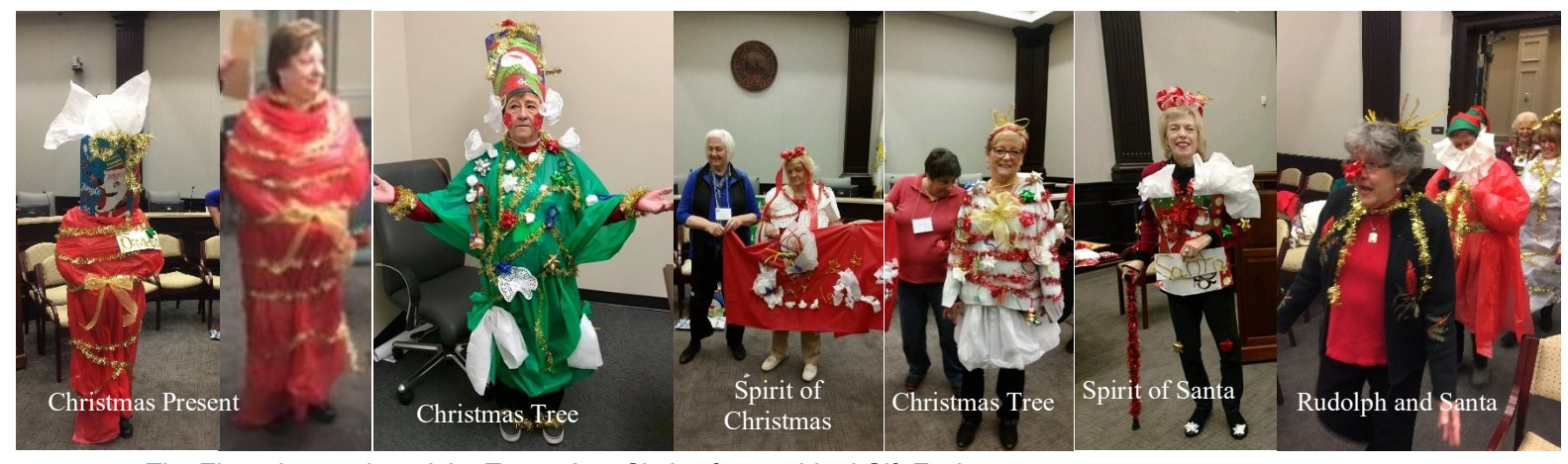
The Elves then gathered the Teams into Circles for a spirited Gift Exchange...

helped guide six teams through creation of