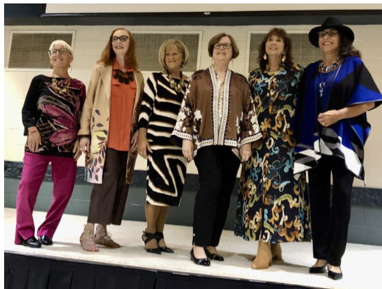
Our Lovely models from the 2022 Fall Fashion Show