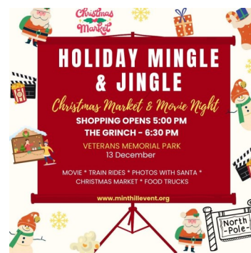
Holiday Mingle & Jingle on December 13